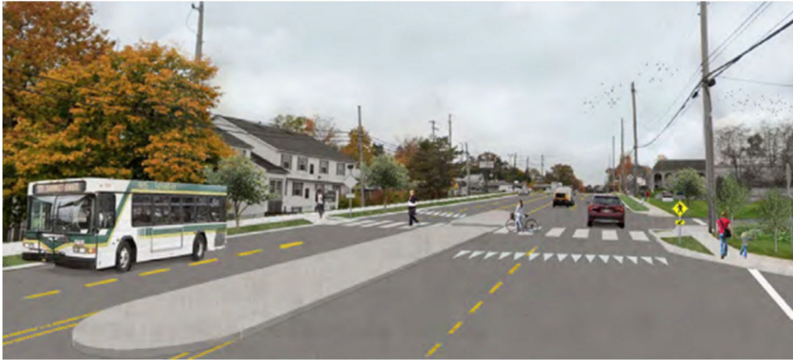
Figure 3 – Proposed mid-block crossing with pedestrian islands

The design of the project was started with the assistance of a $666,000 grant from the Ohio Department of Transportation (ODOT) Highway Safety Improvement Program (HSIP). As the design of the project has progressed, the project scope has expanded, in part at the request of ODOT that owns the portion of the project outside of the City. Therefore, we recommend amending the design agreement to include the following: